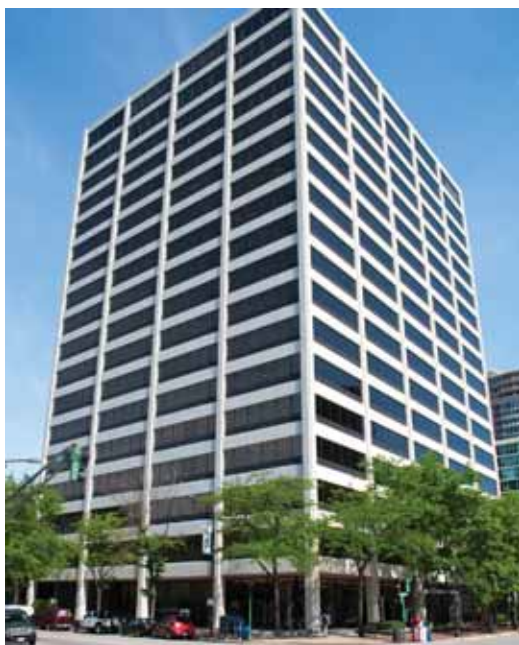
One Rotary Center in Evanston, Illinois, USA

Rotary International is administered by the Secretariat, which comprises the general secretary and nearly 800 employees who work to support clubs and districts around the world. Rotary's world headquarters is in Evanston, Illinois, USA, in a building called One Rotary Center. It includes a 190-seat auditorium, Rotary's archives, and an executive suite with conference rooms for the RI Board of Directors and Rotary Foundation Trustees and the offices of the