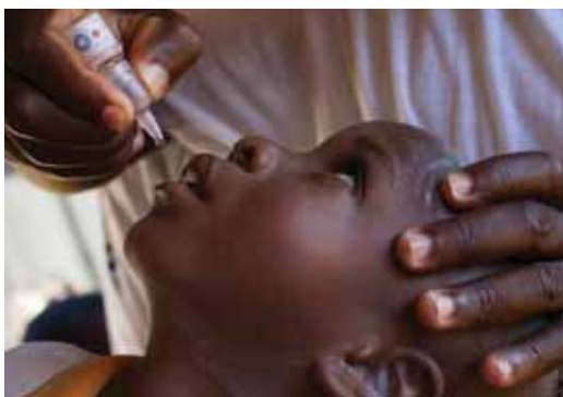
Rotarian administering polio vaccine in Nigeria, Africa

Our members’ and others’ contributions to the Foundation allow us to bring sustainable change to communities in need. Ask your club’s Rotary Foundation committee chair or visit rotary.org/donate to learn how you can support our Foundation. To learn more, download The Rotary Foundation Reference Guide or take the Rotary Foundation Basics course in Rotary’s Learning Center .